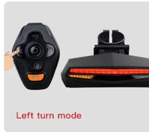
Left turn mode