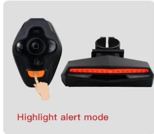
Highlight alert mode