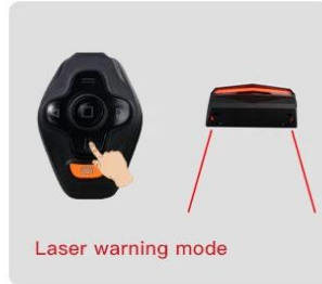
Laser warning mode