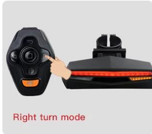
Right turn mode