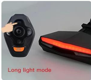
Long light mode