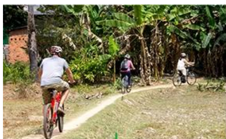
Countryside Sharing Bikes