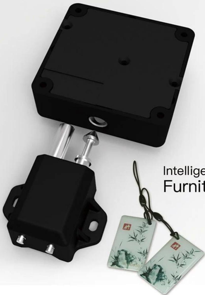
Intelligent Induction Furniture Lock