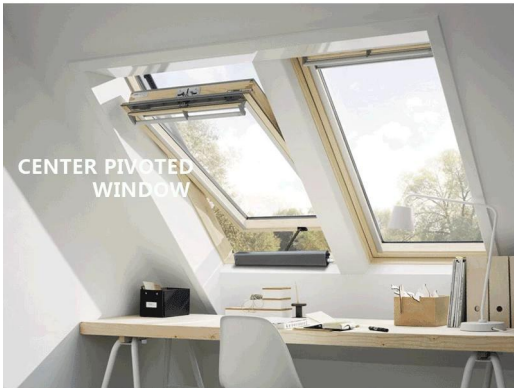
CENTER PIVOTED WINDOW