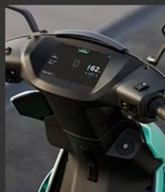
Install wherever you prefer