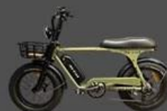
Fat tire bikes