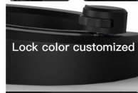
Lock color customized

Less than 100,000 pieces for orders is required to pay the cost for the mold if a new mold is required.