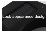
Lock appearance design

Less than 100,000 pieces for orders is required to pay the cost for the mold.