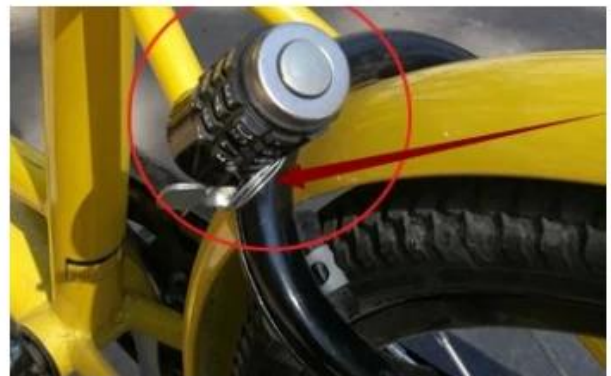
The key is easy to be cracked