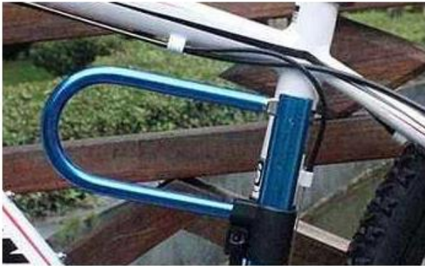
Forgot to bring the key