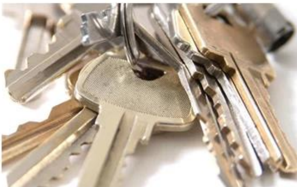
The key is easy to copy