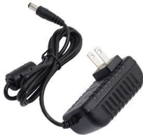
DC charging port

Users and operators can communicate with shared bikes or ebikes through smart bicycle locks.