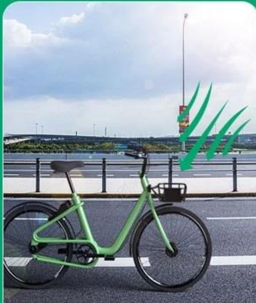
Solar panel charging