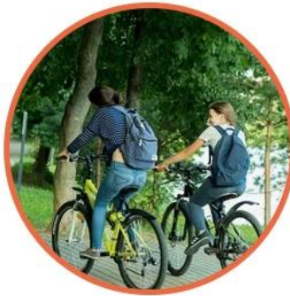
Cycling to and from work