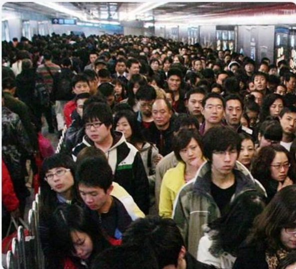
Bus and subway crowded during commute