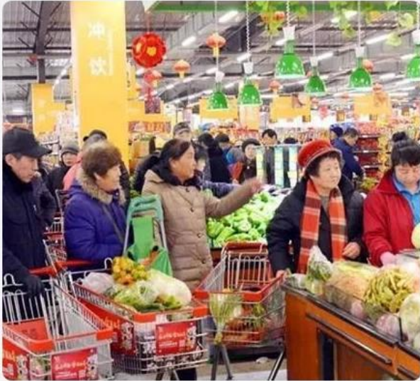
Go to the market to buy food, go to the supermarket