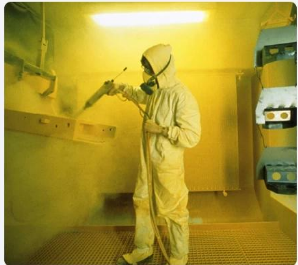
Industrial spray paint