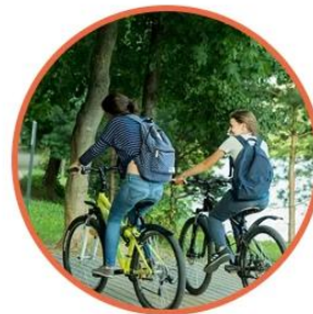
Cycling to and from work