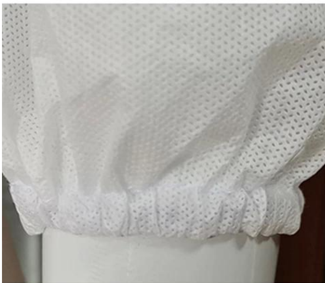
Cuff tightness | Comfortable