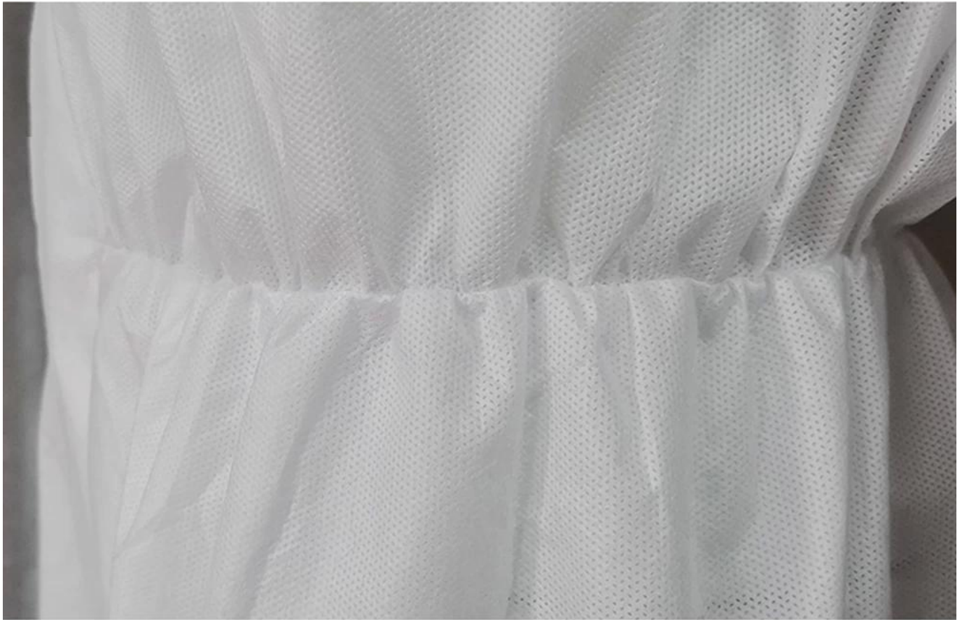
Elastic rope at waist | More comfortable to wear and meet different body needs