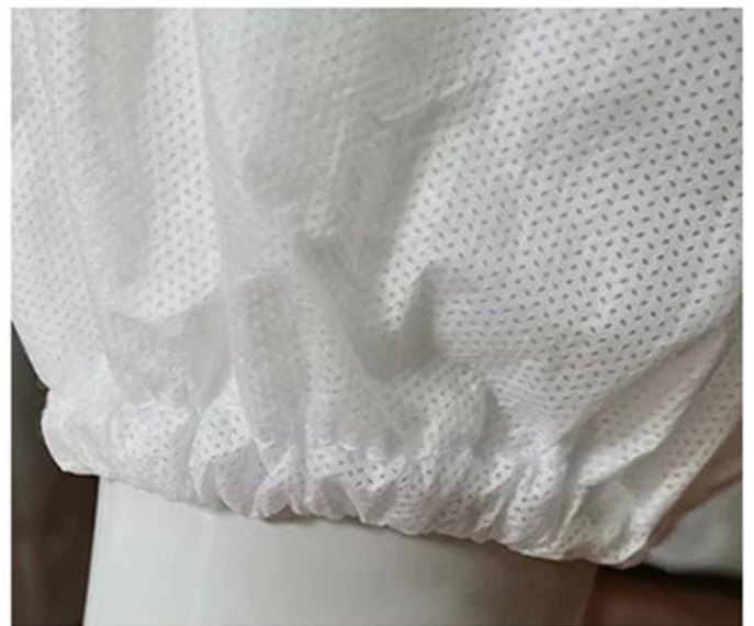
Trouser legs | Easier dust control