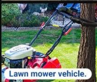
Lawn mower vehicle.