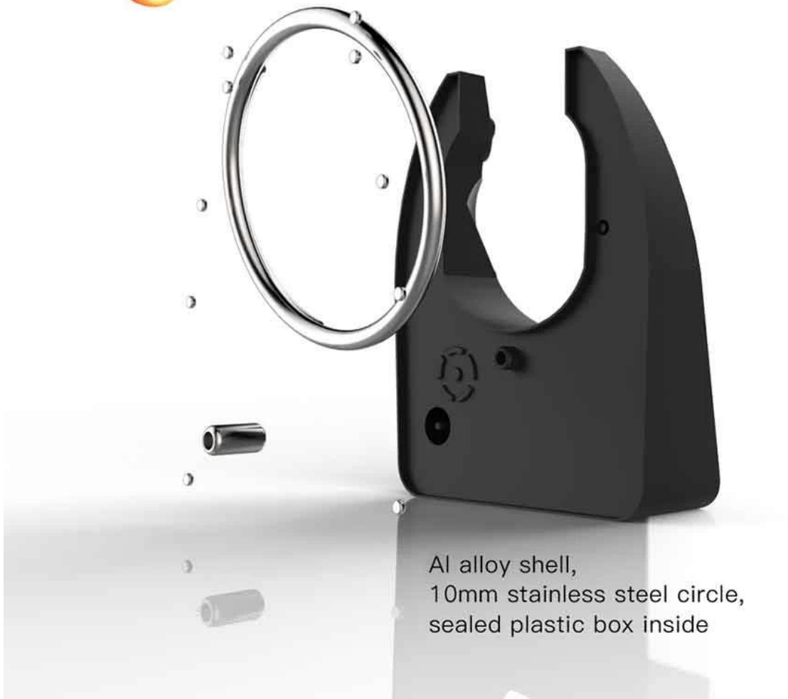
Al alloy shell, 10mm stainless steel circle, sealed plastic box inside