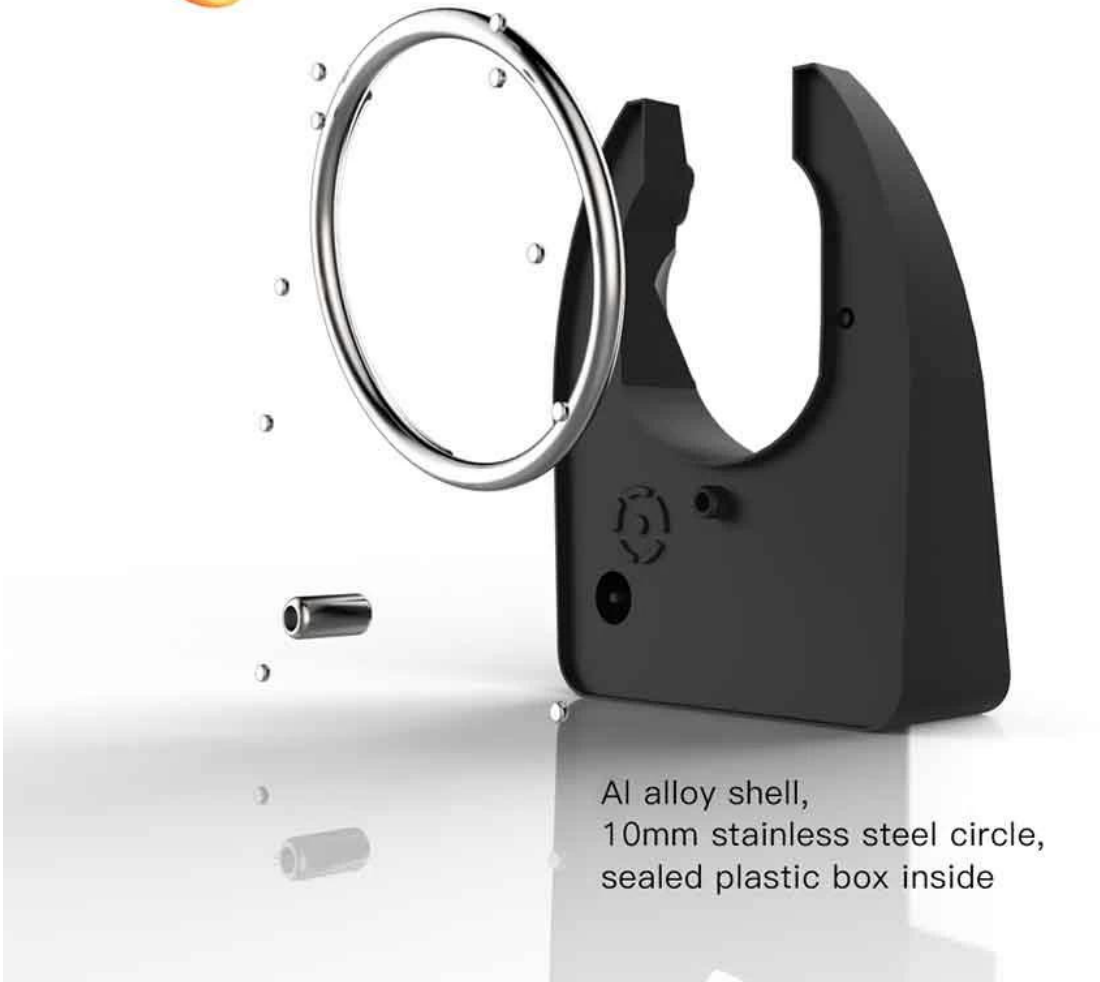
Al alloy shell, 10mm stainless steel circle, sealed plastic box inside