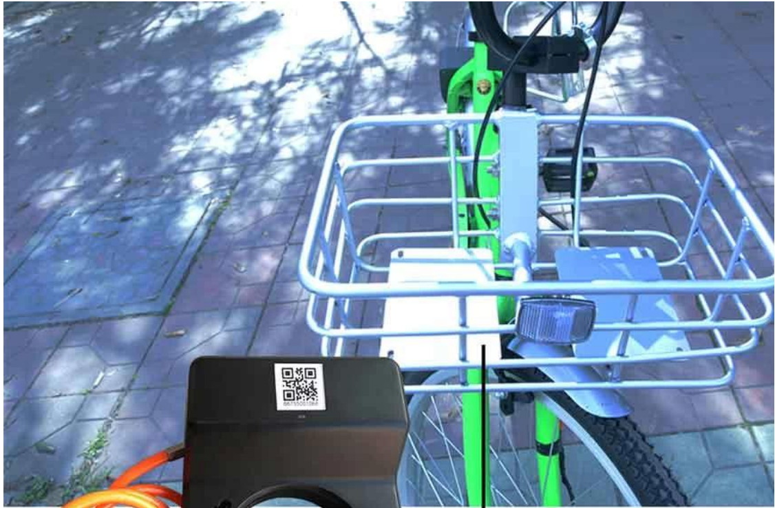
External Power: Solar Penal on the bike