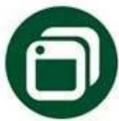
Stable & Durable hardware