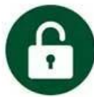
Automatic & scan code to unlock