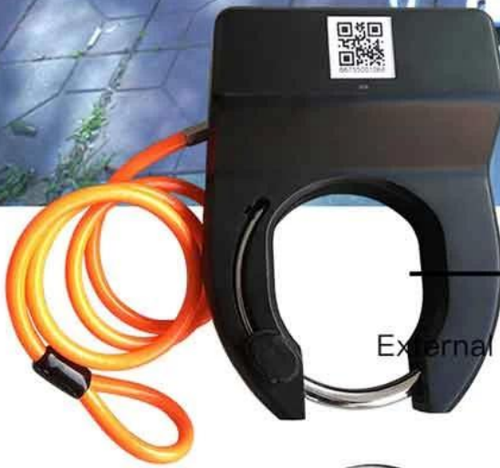
External Power: Solar Penal on the bike